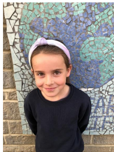
Lyra - Chinchillas