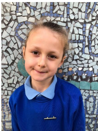
Autumn – Meerkats