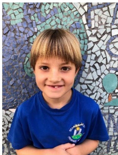
Rufus – Chinchillas