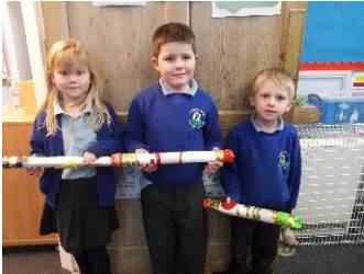
Meerkats made rain sticks