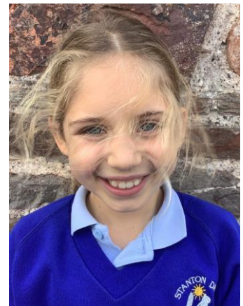
Poppy - Chinchillas