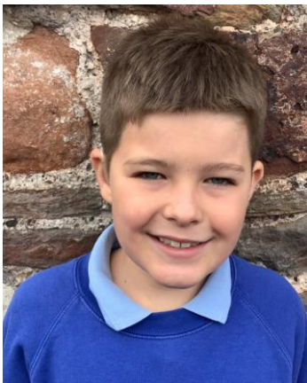
Monty – Chinchillas