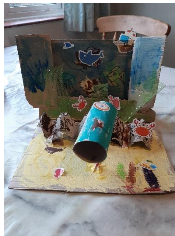
Sidney's Underwater Submarine