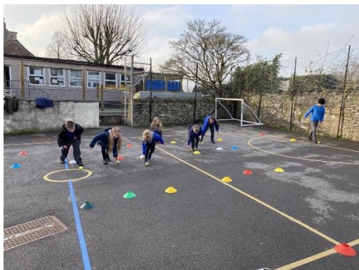
PE on the playground