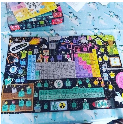
Ieuan's periodic table puzzle!