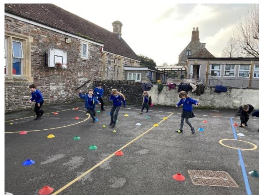
more PE on the playground