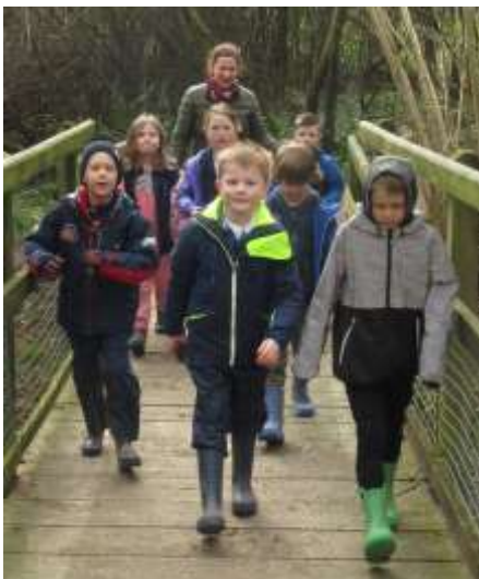
Y1 and Y2 at Folly Farm March 2022